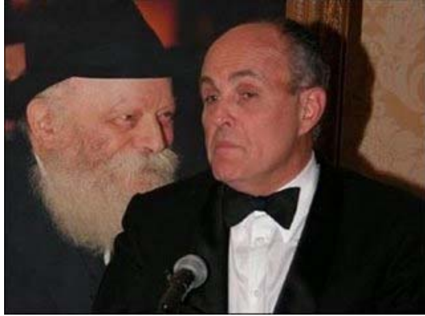
Former Mayor of New York, Rudy Giuliani

...Giving a speech at a Lubavitcher "Award" Ceremony (That's The "Rebbe" [i.e. Rabbi Schneerson: Former Leader of the extremist Lubavitch Movement] in the painting behind him).